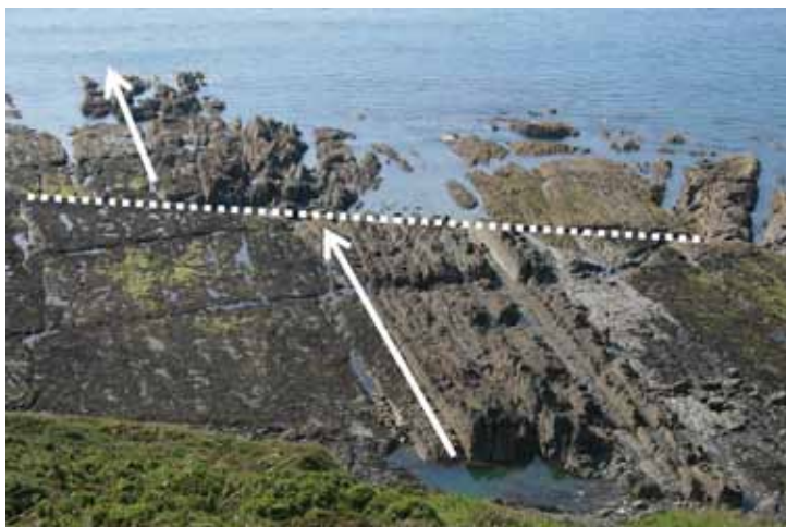
The fault (dotted line) and slippage of rock strata