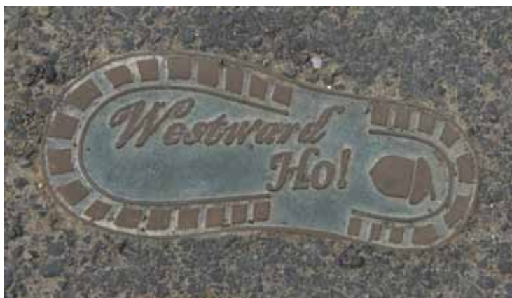
Footprint designating the South West Coast Path